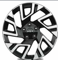
PHEV - 18" alloy