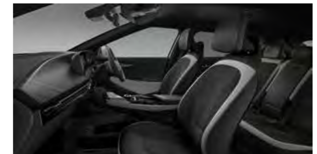
EV6 GT-line S - Black Suede & White Vegan Leather