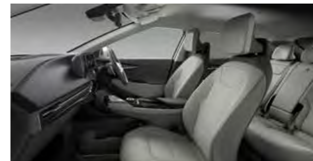
EV6 Earth - Charcoal Grey Vegan Leather