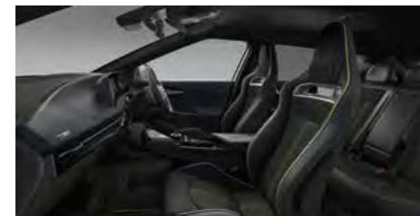
EV6 GT - Black Suede Bucket Seats with Neon Green Stitching