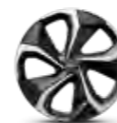
EV6 Earth & GT-line - 20" Alloy Wheels