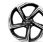
EV6 GT - 21" Alloy Wheels